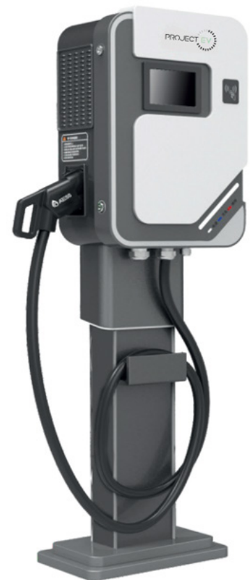
Optional Floor Stand (Not Included)